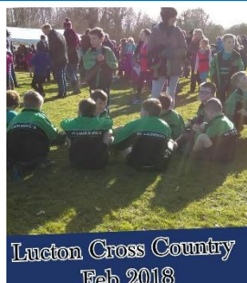
Lucton Cross Country Feb 2018